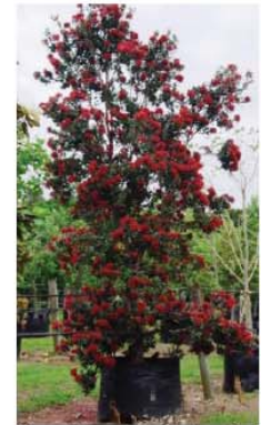
Metrosideros 'maori princess'