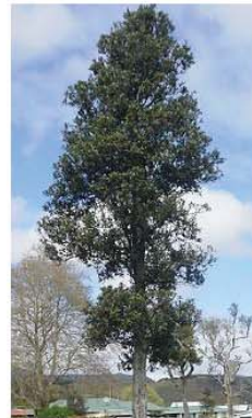
Knightia excelsa . Rewarewa