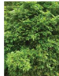
Alectryon excelsa .