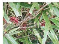
Knightia excelsa . Rewarewa