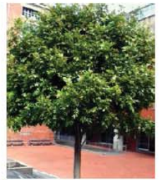
Metrosideros excelsa .